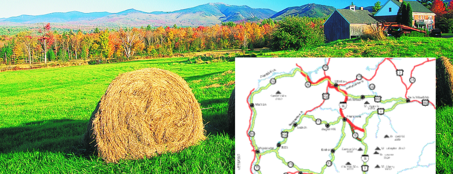
Excellent sources of water make for rich farmland. Above: Sugar Hill.

This route provides views of mountain scenery, working farms and the beautiful Connecticut River Valley. Along the way you'll pass quintessential New England towns and resorts, as well as forests where you can take advantage of many recreational opportunities.